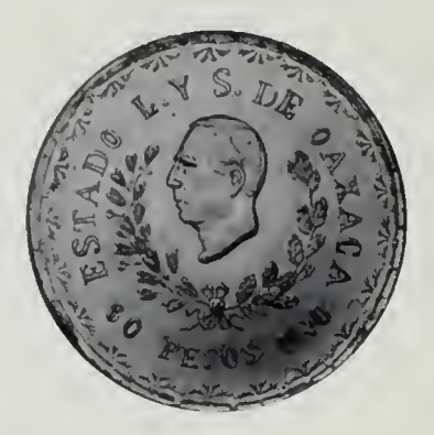
Lot No. 2433